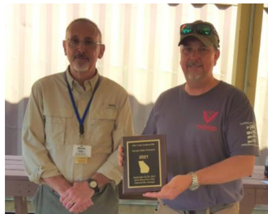
Shane Collier Award