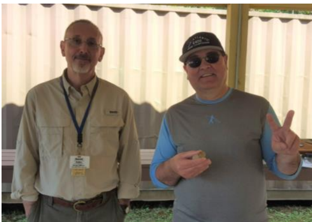
Mike Carter Award