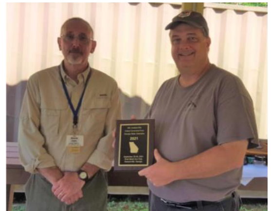
Larry Sollars Award