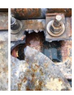
Plate 2 Rear Closeup