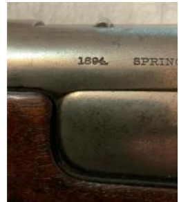
"1894": Receivers marked with the year 1894 or 1895 are Model 1892 Krags

Starting with the Model 1896, a Cavalry Carbine was produced. The Rough Riders of the Spanish-American War fame were armed with Model 1896 Carbines. A small number of Model 1898 Carbines were made before it was decided to produce a carbine-only version of the Model 1898, the Model 1899.