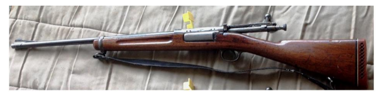
An example of a rifle cut down (both barrel and stock) to make a sporter/hunting rifle.

Fortunately, rifles converted to sporting/hunting rifles are often moderately priced and are an opportunity for the shooter to own one of these historic rifles. You will often see a sporter listed as a carbine, but almost all are cut-down rifles. Educate yourself on the differences before paying for an original carbine that is, in fact, a cut-down rifle.